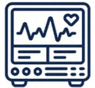
Medical Devices & Equipment