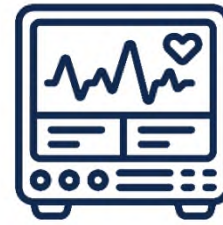
Medical Devices & Equipment