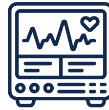
Medical Devices & Equipment