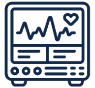
Medical Devices & Equipment